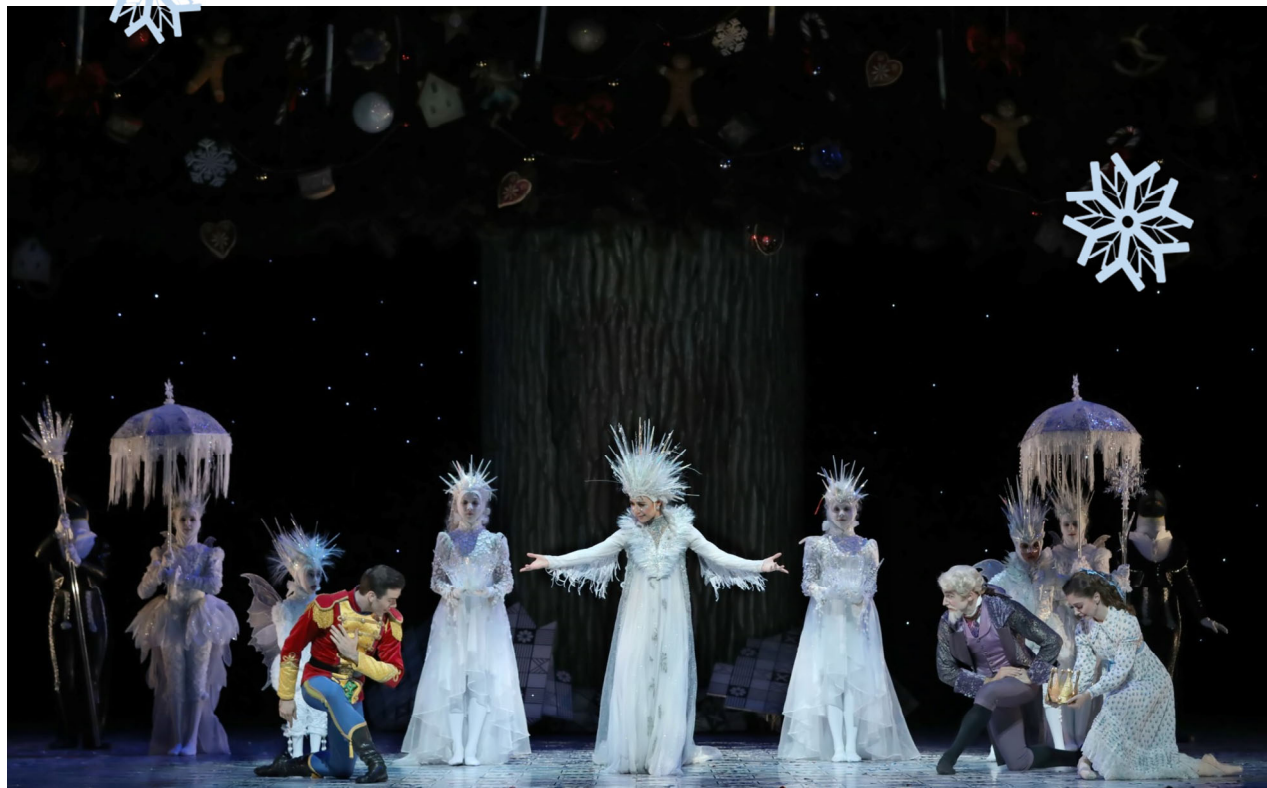
Artists of Houston Ballet in Stanton Welch's The Nutcracker .