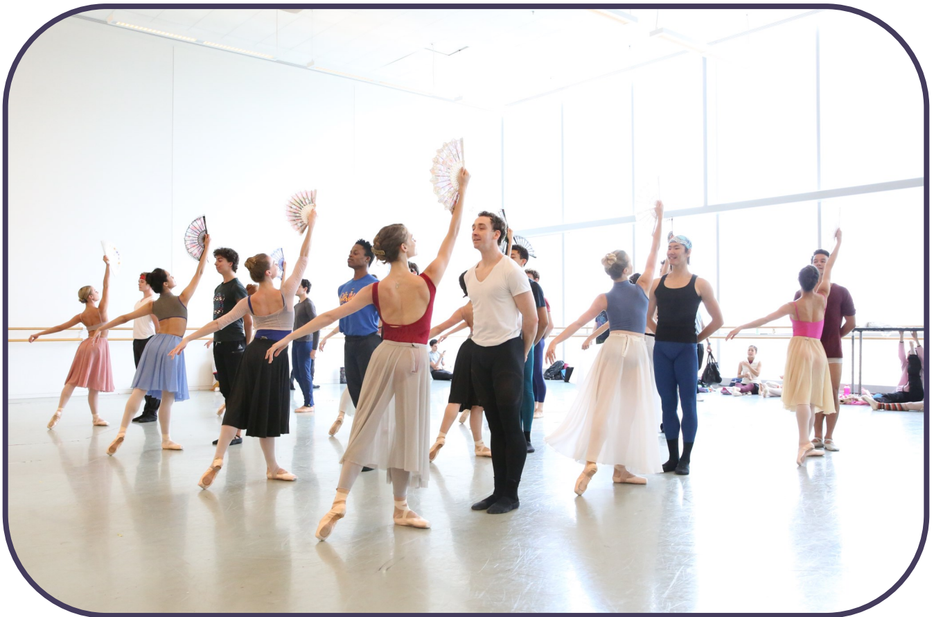
Artists of Houston Ballet rehearsing The Merry Widow

THEATRE.III.5.D compare communication methods of theatre with those of art, music, dance, and other Readiness Standards/Aligned Readiness